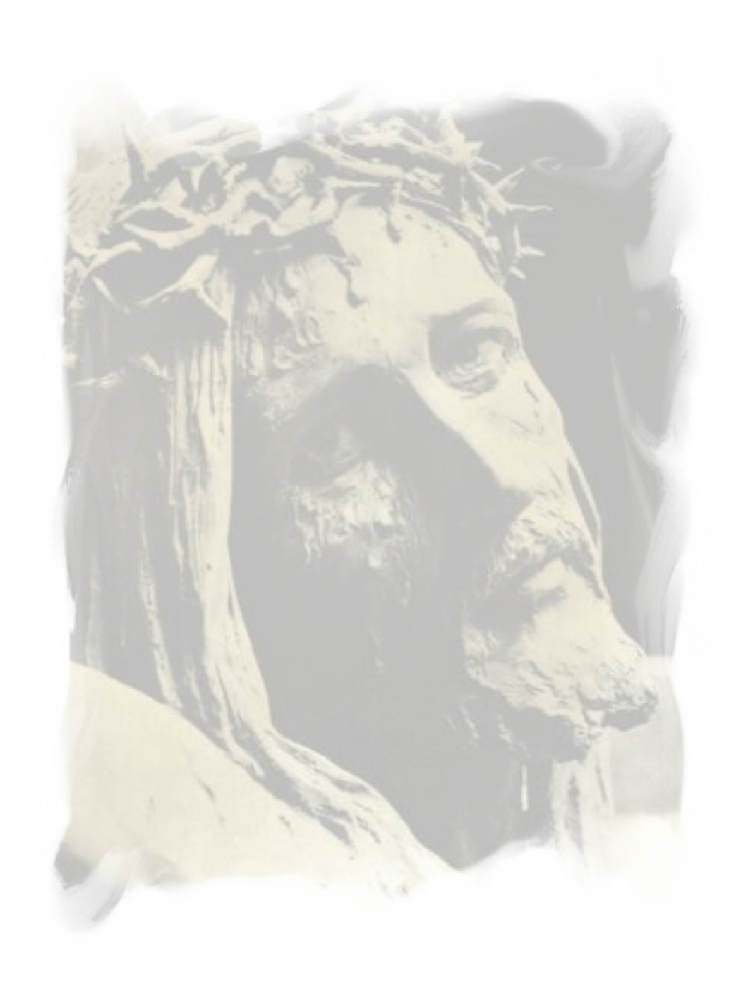
by Blessed Annibale M. di Francia